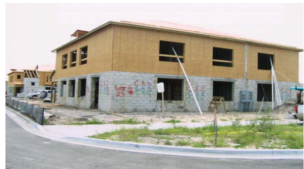
Construction on the quad units is underway.

Central Maintenance Facility: Conceptual designs for rehabilitation of the Central Maintenance facility have been prepared by OB Architects, the firm that designed the Villas at Carver Park. The intent is to have the Central Maintenance facility blend in with the surrounding Carver Park buildings.