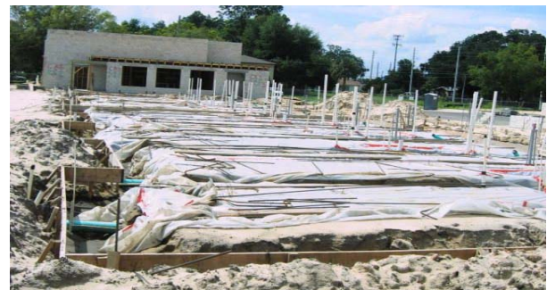
Rental rowhouses are also under construction.